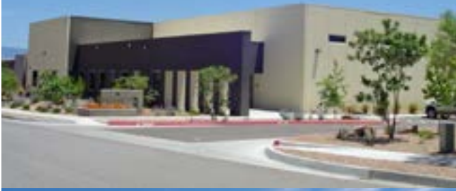
Garden - Office